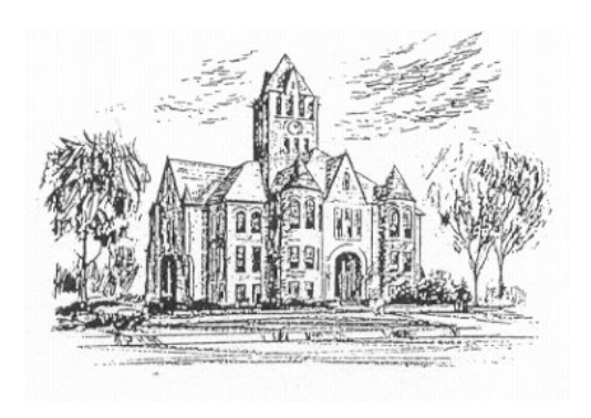
Fulton County Vaccine Locations Officer