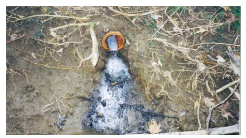
Sewage draining into a ditch is a significant public health hazard.