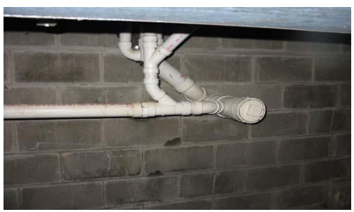
A certified evaluator will check the interior plumbing to make sure it is properly connected to the septic system and is without leaks.